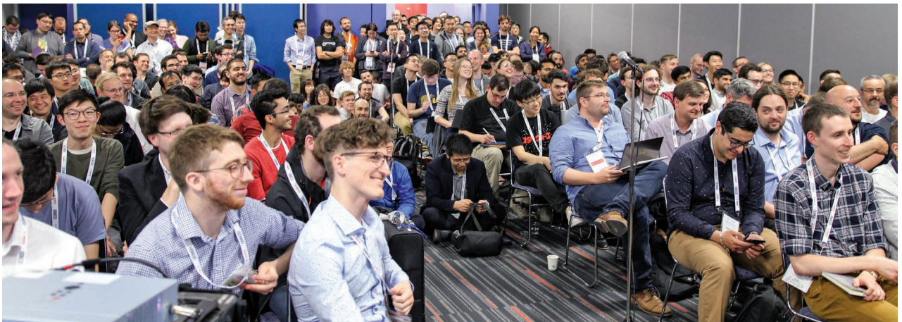
Figure 1. The capacity crowd attending the 2019 ICRA Debates on the Future of Robotics Research workshop.